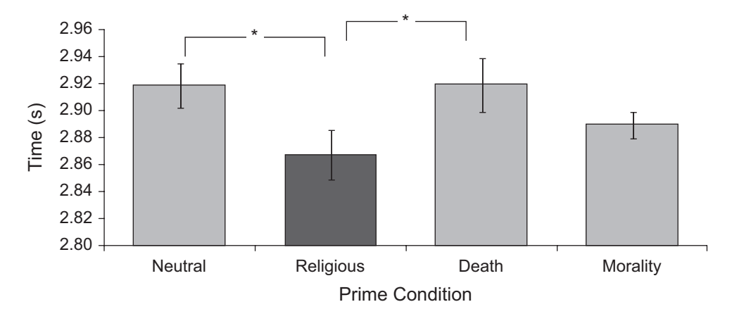
Fig. 2. Mean reaction time on the Stroop task as a function of priming condition in Study 4. Error bars represent standard errors. Asterisks indicate significant differences between conditions (*p < .05).

people's ability to endure negative experiences in a number of behavioral domains that are arguably central to both major religions and human evolution.